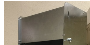
← Side Section

Back Box (1) - The FX RB Back Box comes in three parts; a center section and two side sections as shown below. Sheet Metal Screws (4) - For Back Box Assembly